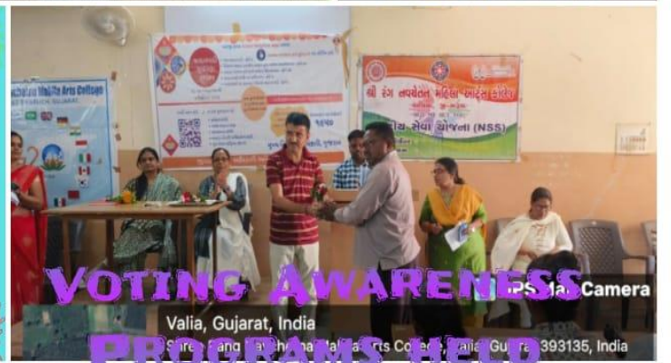
VOTING AWARENESS PROGRAMS HELD Valia, Gujarat, India Shree Rang Navchetna Mahila Arts College, Valia, Gujarat 393135, India

મામલતદારશ્રીની કચેરી વાલીયાના સંગુકલ ઉપક્રમે આયોજિત મતદાર જાગૃતિ અભિયાન કાર્યક્રમ આયોજક મામલતદારશ્રીની કચેરી વાલીયા એનએનએસ અને ઈલેક્ટોરલ લિટરેસી કલબ તારીખ - 4/11/2023 બપોરે 12.00 કલાકે કમા નંબર - 3