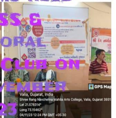
BY NSS & ELECTORAL LITERACY CLUB ON 4TH NOVEMBER 2023 Valia, Gujarat, India Shree Rang Navchetna Mahila Arts College, Valia, Gujarat 393135, India