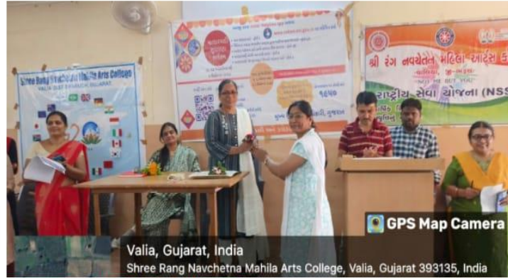
Valia, Gujarat, India Shree Rang Navchetna Mahila Arts College, Valia, Gujarat 393135, India

MAHENDI COMPETITION ON JULY 15 2022 UNDER THE BANNER OF KAUSHIYADHARA