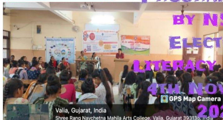
Valia, Gujarat, India Shree Rang Navchetna Mahila Arts College, Valia, Gujarat 393135, India